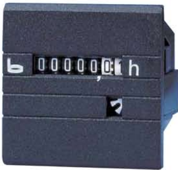
type 632.2, 632.3, 634.2, 634.3, 630.2, 630.3, 638.2, 638.3

Front frame 48 x 48 mm, cutout \square 45,2 + 0,3 mm