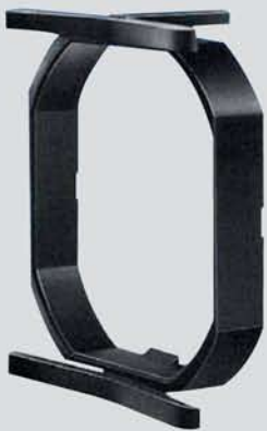
* This retaining clip is included in the delivery at types for flush mounting (panel thickness up to 10 mm)