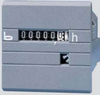
type 631.2, 631.3, 633.2, 633.3, 629.2, 629.3, 637.2, 637.3

The world-wide known BAUSER hour counters can be fast and easily mounted. As the counters are available in all current front dimensions, you do not require additional bezels.